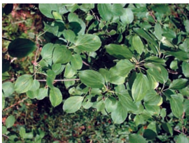
Luke Skinner, MnDNR

Flowers Small, yellow-green color; 4 petals; produced in May.