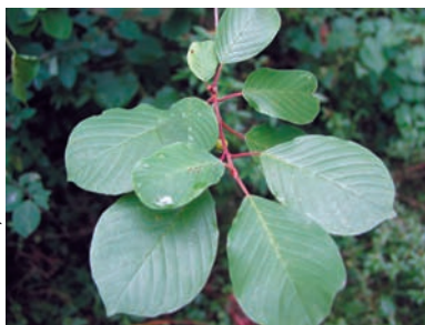
Luke Skinner, MnDNR

Flowers Small, creamy-green color; 5 petals; produced in late May-June.