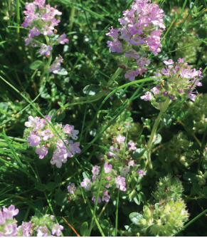
Dutch White Clover