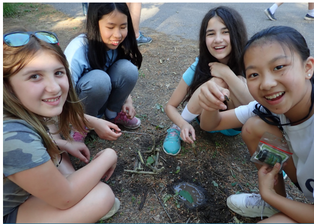
Campers participate in a campfire building contest.

Experience conservation problem-solving, night time hikes, wildlife ecology, and much more.