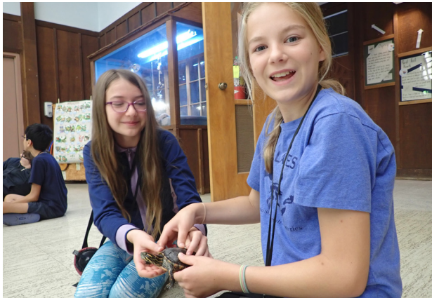
Campers learn more about native WI wildlife.

Make new friends! Camp gives you the chance to meet new people, including conservation professionals and other campers from around the state.