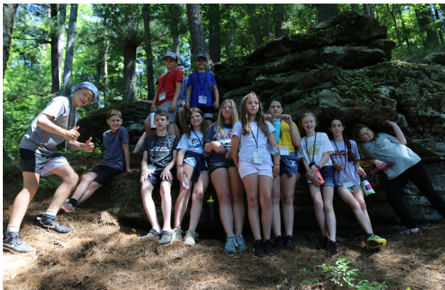
Campers explore Blackhawk Island.