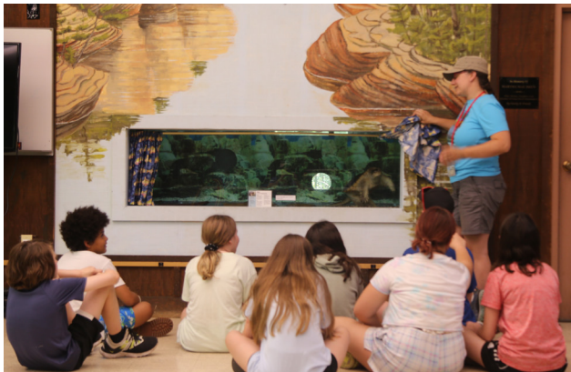
Conservation professionals teach campers about the natural world.