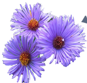
AROMATIC ASTER ( Symphyotrichum oblongifolium ) Blooms Aug-Nov