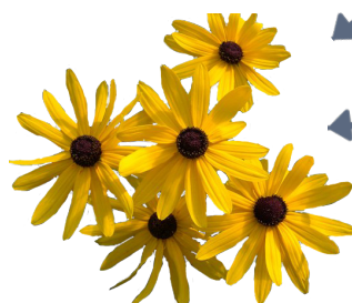
ORANGE CONEFLOWER ( Rudbeckia fulgida ) Blooms Jul-Sep