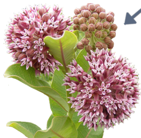
COMMON MILKWEED* ( Asclepias syriaca ) Blooms Jun-Aug