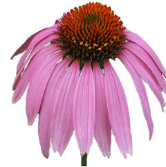
PURPLE CONEFLOWER ( Echinacea purpurea ) Blooms Jul-Sep