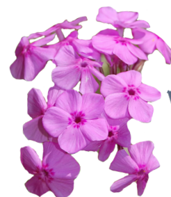
PRAIRIE PHLOX ( Phlox pilosa ) Blooms May-Jul

Many of these flowers need a period of freezing in order to germinate. Scatter seeds in your yard just before a snowfall, or cold stratify and germinate them indoors to give them a jump-start in spring! Bloom times provided by Prairie Moon Nursery.