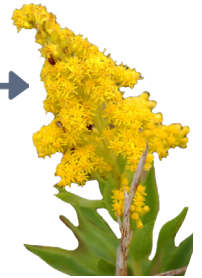
SHOWY GOLDENROD ( Solidago speciosa ) Blooms Sep-Nov