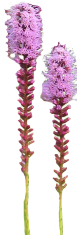
MEADOW BLAZING STAR ( Liatris ligulistylis ) Blooms Aug-Sep