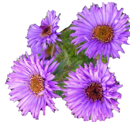
NEW ENGLAND ASTER ( Symphyotrichum novae-angliae ) Blooms Aug-Oct