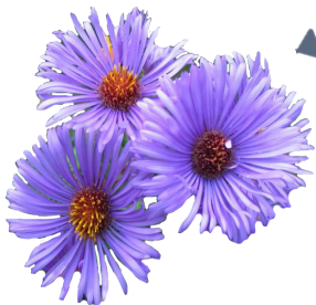
AROMATIC ASTER ( Symphyotrichum oblongifolium ) Blooms Aug-Nov