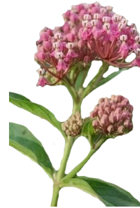
RED (SWAMP) MILKWEED* ( Asclepias incarnata ) Blooms Jun-Aug