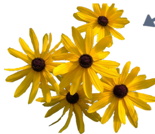
ORANGE CONEFLOWER ( Rudbeckia fulgida ) Blooms Jul-Sep