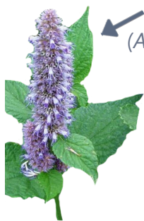
ANISE HYSOP ( Agastache foeniculum ) Blooms Jun-Sep

Turn your yard into a monarch oasis! These 11 Wisconsin-native plants are some of monarchs' absolute favorites. Three species of milkweed (a plant on which monarchs 100% depend, denoted by *) are included! Learn how you can help monarchs at wimonarchs.org .